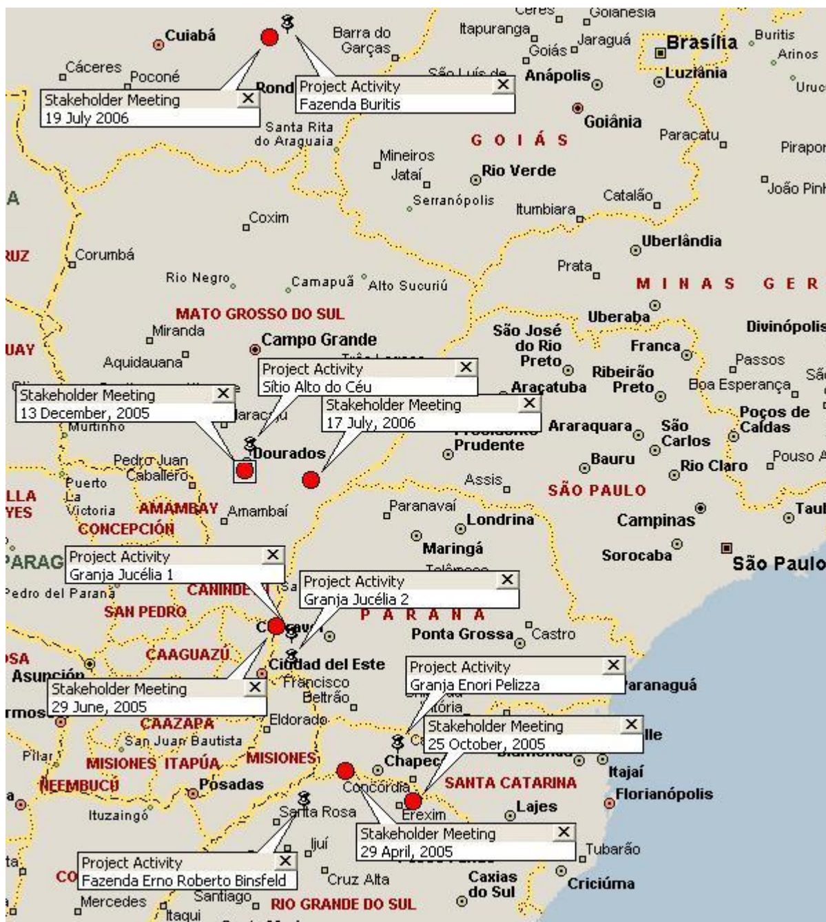
Figure A1. Project Activity Sites in Mato Grosso do Sul, Mato Grosso, Parana, Rio Grande do Sul, and Santa Catarina, Brazil.

approximately 40m x 20m x 2m. Effluent is disposed of from the lagoons through irrigation. Construction of the anaerobic digester was completed on 29 January, 2006. The digester consists of 1 cell, approximately 30m x 12m x 5m.