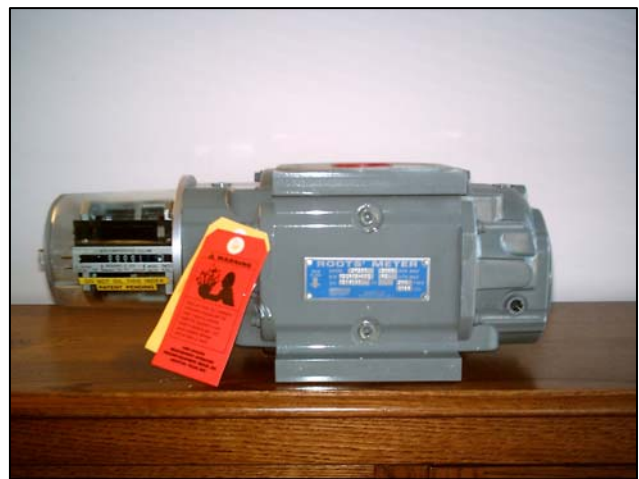
Figure 2. Roots biogas flowmeter

Biogas produced in the anaerobic digester is trapped under a positive or negative pressure geomembrane cover installed over the digester cell. The biogas is routed from the digester to the flare via PVC tubing. A flow meter, which measures gas flow, is fitted in the biogas transfer system piping.