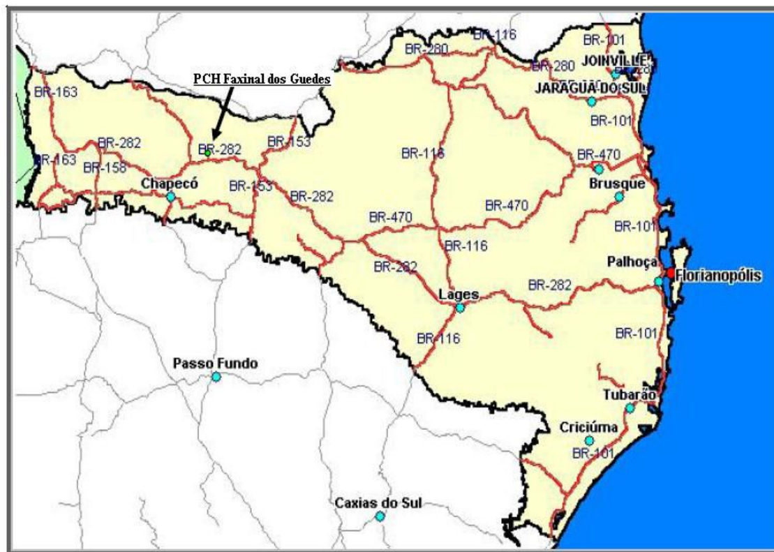
Figure 1: Map of Santa Catarina State showing the project location

The FAXSHP is located in the kilometer 81 of Chapecozinho river, in the Municipalities of Faxinal dos Guedes and Ouro Verde, Santa Catarina State, Brazil (Figure 1). The coordinates are 26° 26' South, 52° 14' West.