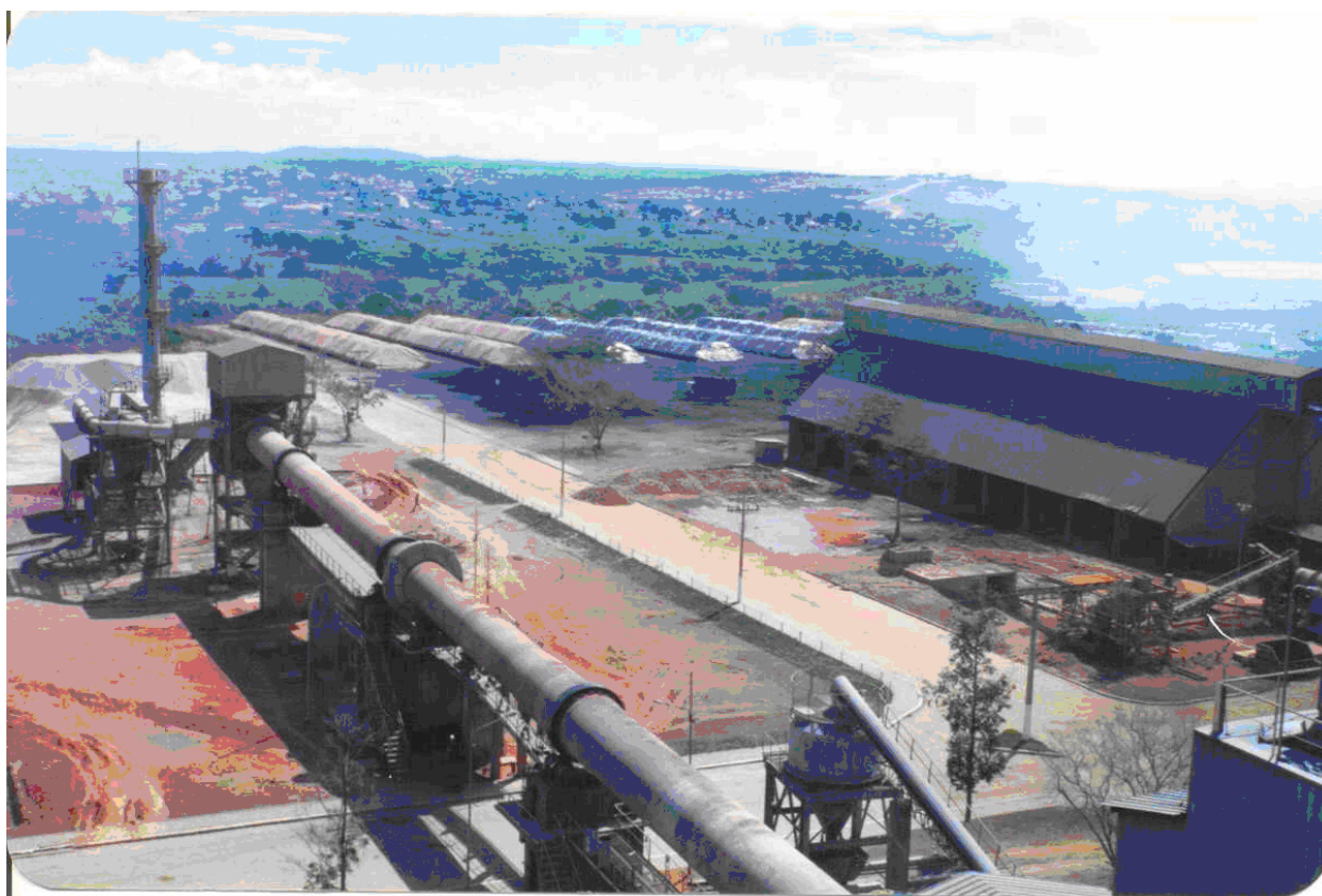
Figure 1 – Photograph of the plant, showing the dolomite kiln in the foreground and the piles of charcoal in the background

The temperature profile in the kiln is the main operating parameter and is set according to the quantity and quality (Mg content) of raw material (dolomite) being fed. The temperature profile is basically determined by fuel flow, which is controlled by a load cell located right before the burner.