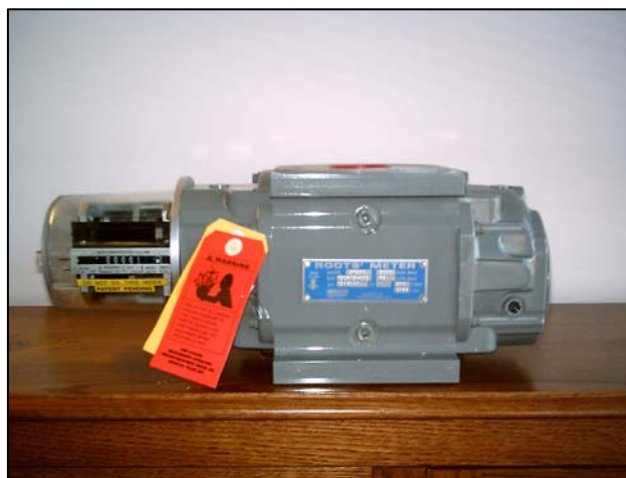
Figure 2. Roots biogas flowmeter

Biogas produced in the anaerobic digester is trapped under a positive or negative pressure geomembrane cover installed over the digester cell. The biogas is routed from the digester to the flare via PVC tubing. A flow meter, which measures gas flow, is fitted in the biogas transfer system piping.