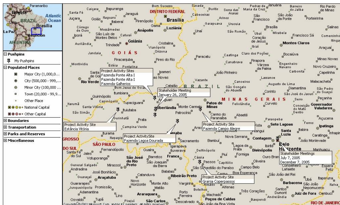
Figure A1. State of Minas Gerais, Brazil project activity sites